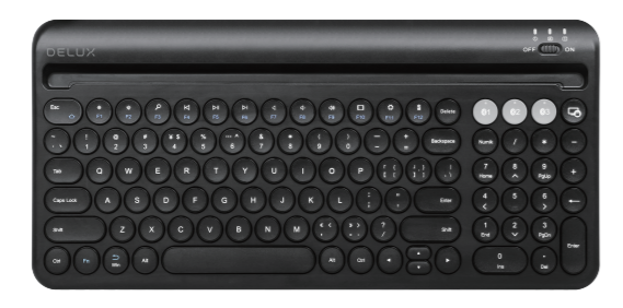
K2212V Membrane Keyboard

Thank you for choosing our Membrane keyboard. Please read the user manual carefully before using this product.